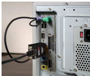
Direct connect CAT5 Transmitter streamlines your installation

Europe and Asia, Rose provides a full range of capabilities and support. Call us today for more information about this and other Rose products.