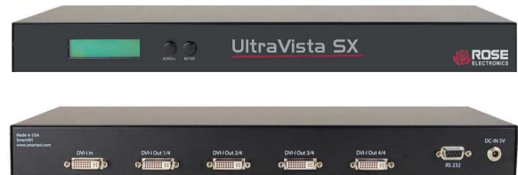
Front / Rear view