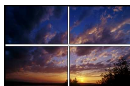
Display a video source across four displays

UltraVista SX maintains the original resolution quality of the input image on all monitors, producing a crisp, clear, perfect image.